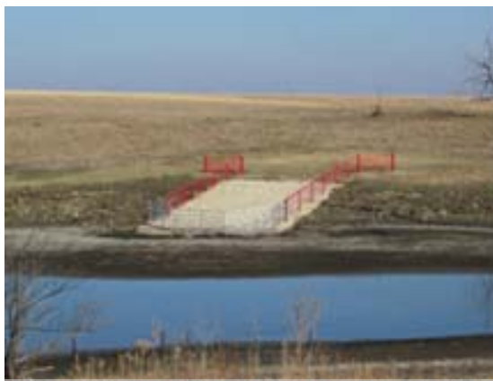
Figure 1. Limited access watering site.

Water development is perhaps the most important investment we can make to land resources. Ponds that cattle are allowed free access to are estimated to cost from $300 to $600 per year more than a fenced pond, in terms of lost water storage and increased maintenance costs. Adding watering sites can improve grazing distribution and beef produced per acre. The management of water, cattle, land and money is all tied together. Wise management of water will be wise management for the other three.